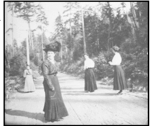
Ladies out for a walk on the early wagon road through Union

Local Road Foremen were hired. Alex McLeod was the first in Union Bay. With his team and wagon he filled the potholes with gravel from the beach now called Craigdarroch. 1 st , 2 nd , 3 rd , and 4 th Roads went down from the highway to the beach, where the gravel was hand-loaded onto the wagon then spread on the road by removing one or two floorboards. It was leveled by his team pulling huge scrapers.