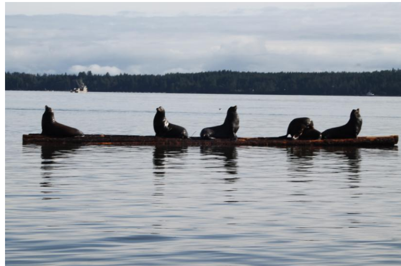
Sea Lions bumming a ride in Baynes Sound