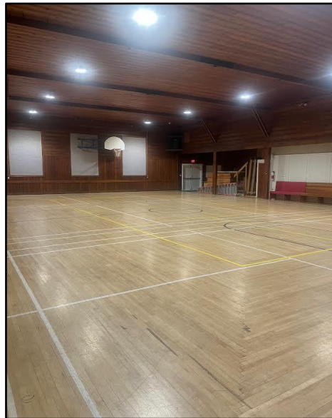
New lights in main hall